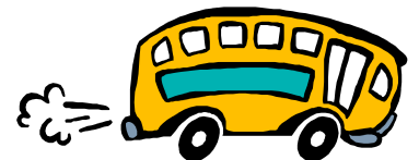
Caravan on the road again.